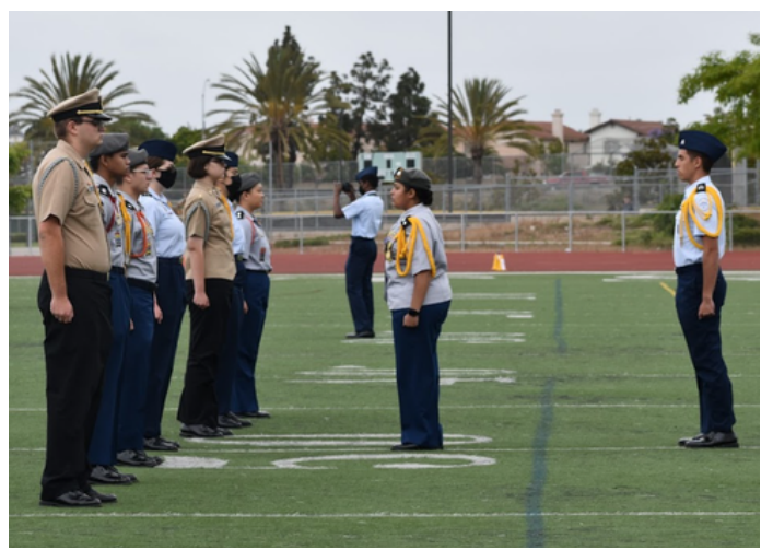
Outgoing Brigade Staff

On May 21, 2022 the 13 units that make up the SDUSD JROTC Brigade were able to come together and gather at Lincoln High School to recognize and honor the hard work that has been put into the 21-22 school year.