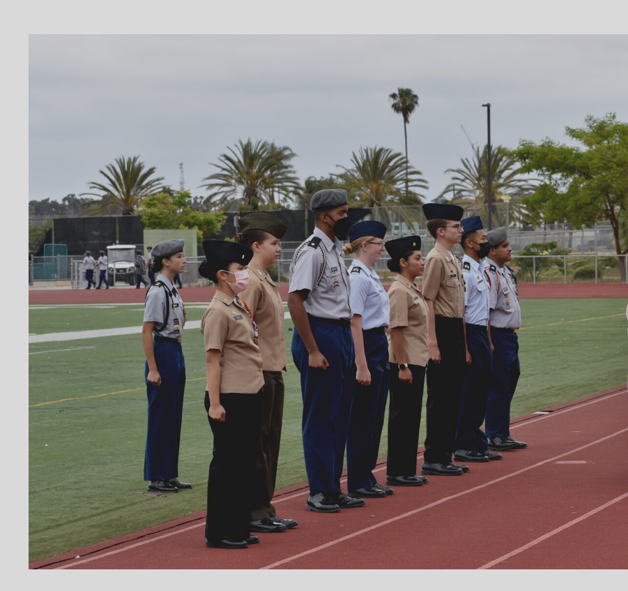
Incoming Brigade Staff