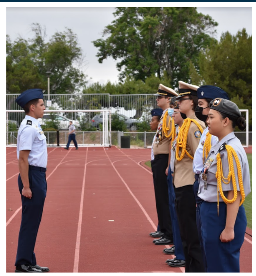
Outgoing Brigade Staff being dismissed for a last time by their Brigade Commander.